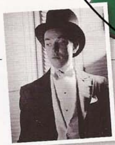
Charles Eames 1907-1978

Strap up this '60s staple—Marimekko's fully-lined "Lei" cotton tunic, $279. (us.marimekko.com)