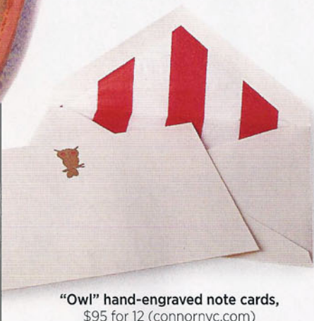
"Owl" hand-engraved note cards, $95 for 12 (connornyc.com)