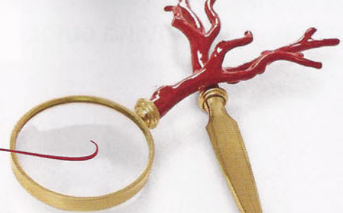
"Coral" magnifying glass and letter opener from L'Objet, $110 each (l-objet.com)