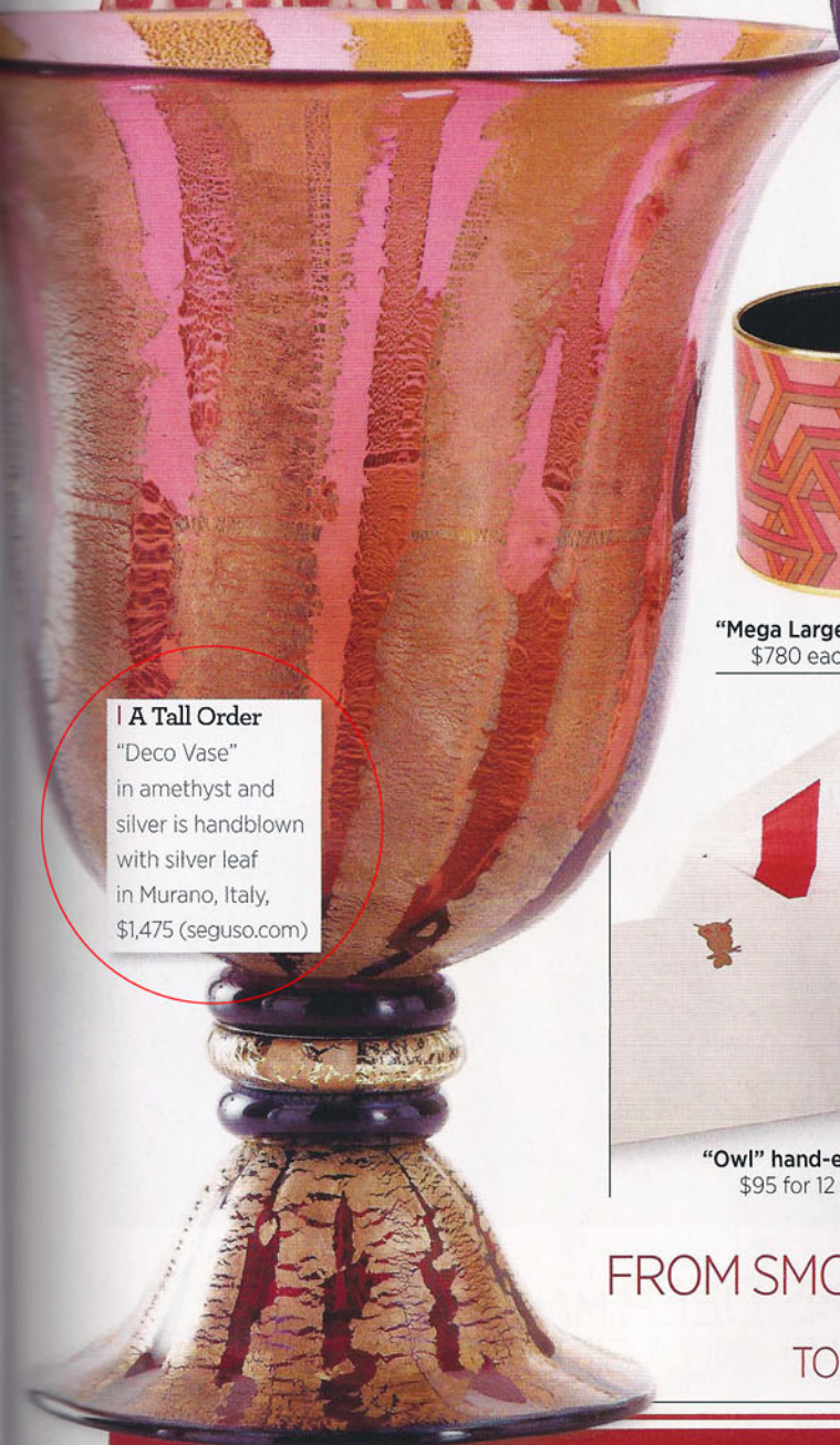
| A Tall Order "Deco Vase" in amethyst and silver is handblown with silver leaf in Murano, Italy, $1,475 (seguso.com)