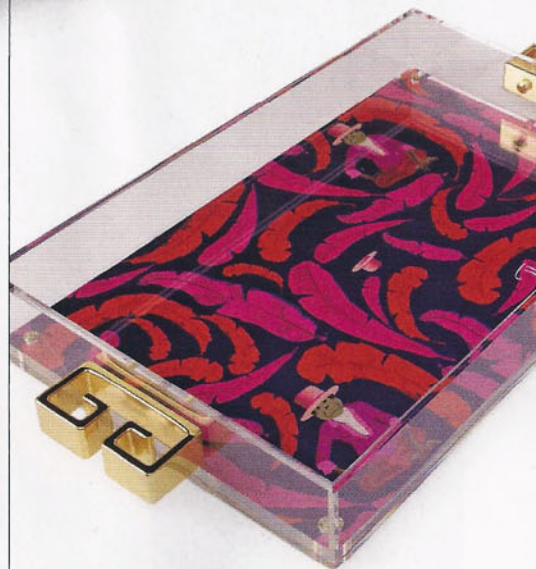
Customized large Lucite tray, $300 (shopiomoi.com)

FROM SMOLDERING TO PREPPY—RED-HOT REDS ARE A FESTIVE AND BEGUILING WAY TO CELEBRATE THE SEASON.