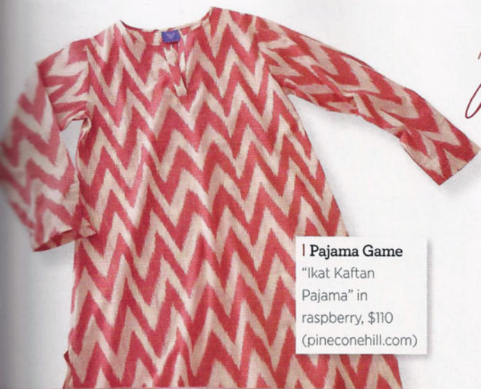
| Pajama Game "Ikat Kaftan Pajama" in raspberry, $110 (pineconehill.com)