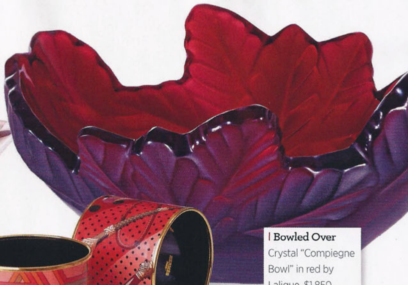
| Bowled Over Crystal "Compiègne Bowl" in red by Lalique, $1,850 (212/355-6550)